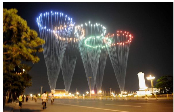
Five Golden Rings: Fireworks Project for the Opening Ceremony of the 2008 Beijing Olympic Games (2008)

terms like Dao (Tao – the Way) or Kong (Emptiness) - in contrast to earlier rejection for opposite reasons, and in disregard of all the sophisticated meta-layers of East-West playfulness so ingeniously spotted by their western-based colleagues (Liu 2008). Still, other critics have followed up on precisely that line and seem quite up to date with regard to what has been termed the post-orientalist aspect: A veritable Chinese box system of mutual receptions, orientalisms, and parodies of orientalisms, manipulated by transnational identities, endlessly mirroring each other in sophisticated and self-conscious manners.