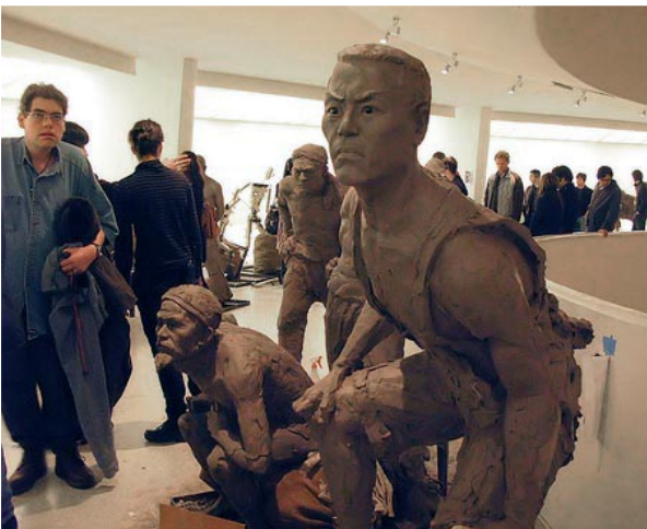
New York’s Rent Collection Courtyard (2008)

and as something that should be displayed for the entire world to see. The Venice Biennale, being perhaps the most prestigious and conspicuous international art exhibition, the focus of global attention, would seem to fulfil precisely the ambitions expressed by the Sichuan Academy. But “appropriated by an overseas Chinese artist”, renamed with the prefix Venice, it becomes simply a case of plagiarism. Beneath some of the rhetoric one may also detect an uncanny sense, on the part of the offended, of socialist art being ridiculed. Despite the fact that the Academy soon withdrew its lawsuit, a heated debate ensued in Chinese media, as to whether Cai Guo-Qiang had violated the rights of individual artists, or just borrowed someone else’s work in order to perform a postmodern work of art, like Andy Warhol and others had done before him (Wu 2001: 57). Indeed, seen from the point of view of modern western art, we may, as David Joselit, discuss Cai’s Rent Collection Courtyard as belonging to the tradition of the ready-made, or rather what Cai Guo-Qiang himself has referred to in terms of “cultural readymade” (Cai 2000). According to Joselit, Cai here demonstrated a diasporic revision of the readymade, in the sense that the artist’s position as an ethnically Chinese person based abroad and exhibiting internationally was at stake in how a “cultural readymade” accrued meaning for different audiences (Joselit 2008: 50).