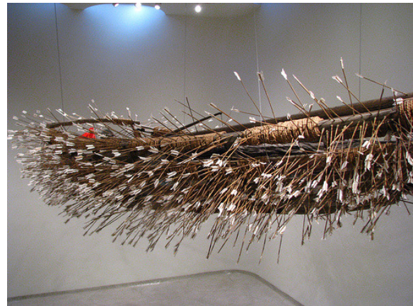
Borrowing Your Enemy's Arrows (1998)

from all over the world. One series entitled Project for Extraterrestrials , conceived to be viewed from outer space, include the 1993 "Project to Extend the Great Wall of China by 10.000 Meters", realized in Gansu Province at Jiayuguan, by adding a ten kilometre gunpowder fuse to the Wall and igniting it. Gunpowder and fireworks, in Chinese huoyao , lit. "fire-medicine", with its transformative power, to Cai epitomizes the kind of conceptual and actual opposites that are central to his work: creation and destruction, careful planning and often unpredictable outcome, war and modernity. One of the "four great inventions" 4 of China it is used for festive and celebratory occasions, but also for bombs and destruction in both East and West, a dual theme played out in a number of installations and performances by Cai in places like Taipei, New York and Hiroshima.