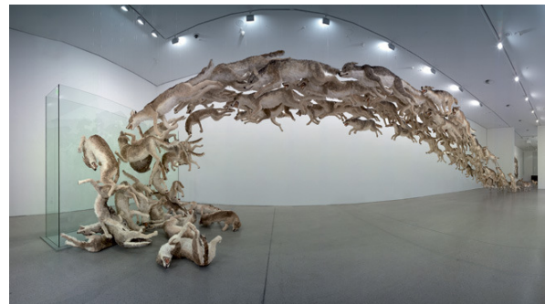
Head On (2006)

for an exhibition of the same name in Berlin in 2006. 8 It shows a pack of 99 life-sized wolves, dramatically charging and smashing against a transparent plexiglass wall, leaping in the air, linked together in the form of a flying arc. The whole installation exudes a powerful atmosphere of raw, blind energy, perhaps rage, of one-directional aggression. Notably, as the pack-leader and the front wolves crash against the wall and tumble down, they are not depicted as realistically wounded, but still aesthetically unharmed.