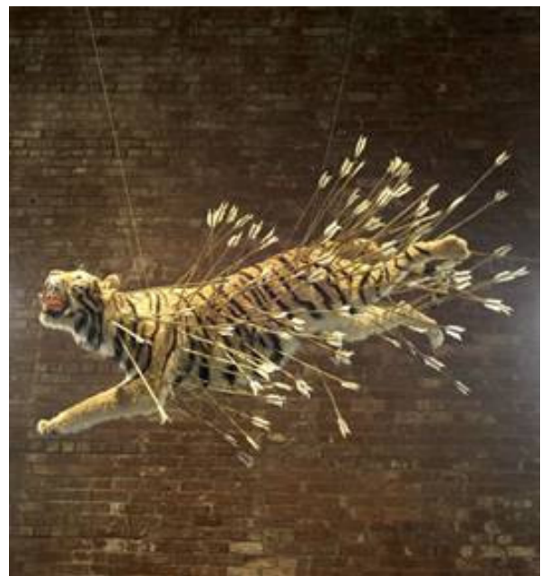
Inopportune: Stage Two (2004)

the heroic Wu Song from the famous novel Water Margin (Chinese: Shui Hu Zhuan ), who killed a tiger. 6 To the intellectual or art-trained western viewer, however, the image of a body penetrated by arrows might give associations to numerous religious pictures of the sufferings of the Christian martyr, St. Sebastian – suggesting another contrastive East-West subtext. We may go even further. By reflecting on the analogous juxtaposition of the two stages of Inopportune , cars and tigers, the parallels of the multitudinous protruding lightning rods and arrows, signifying explosions, attacks and destruction, the spectator may transfer the thus derived dual meanings of arrows on to the installation of Borrowing the Enemy's Arrows , and add the idea of explosion to the straw boat. Hence the ambiguity of message is further underscored – and given yet another dimension if we think of the arrows as acupunctural needles with their healing effect (Cai Guo-Qiang's interest in traditional Chinese medicine resonates in a number of other installations). Thus, the juxtaposition of, and the associative links between, such opposing elements as arrows, lightning rods and needles, suggest an almost oxymoron-like box of meanings.