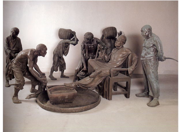
New York's Rent Collection Courtyard (2008)

Perhaps the most intricate work at the Guggenheim retrospective exhibition, in terms of intellectual and artistic ramifications, was also outwardly the most straightforward and realist: The New York's Rent Collection Courtyard (Chinese: Niuyue Shou zu yuan ) This ongoing installation, created in situ during the exhibition period, was a remake of the Venice's Rent Collection Courtyard (Chinese: Weinise Shou zu yuan ) which won Cai Guo-Qiang the Golden Lion at the Venice Biennale in 1999. This again was an almost exact reproduction of a famous socialist-realist sculptural icon of the Mao-era, Rent Collection Courtyard (Chinese: Shou zu yuan ), originally created by artists from the Sichuan Academy of Fine Arts back in 1965. Consisting of more than a hundred life-size clay figures in seven tableaux, it is a powerful example of social-realist political art which shows in vivid detail the ragged suffering tenants cruelly exploited by the despotic merchant landlord. The work was commissioned by the Chinese Central Ministry of Propaganda, and sited in the compound of a former landlord. It was officially hailed as a model work during the Cultural Revolution (1966-76), and hence recreated in various sizes and versions all over China. A fibreglass version was made in 1974 intended for international exhibitions (Erickson 2001: 54) but not actually shown in the West until 2009, by the German Schirn Kunsthalle, during the Frankfurt Book Fair.